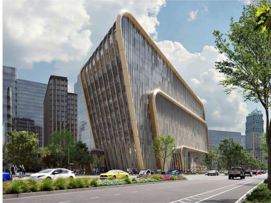
University of Michigan Center for Innovation

The redevelopment of Detroit's convention center will broaden national appeal while improving its function and experience locally. Plans call for building an attached hotel and ballroom and extending Second Street to facilitate access and loading while providing connectivity to the riverwalk.