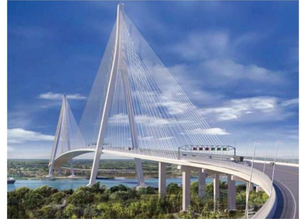
Gordie Howe International Bridge

The $250 million, 200,000-square-foot building is being built by the University of Michigan to provide graduate education, talent-based community development, and community engagement. It's part of the larger $1.5 billion District Detroit development that includes new construction of 6 buildings and reuse of 4 historic properties.