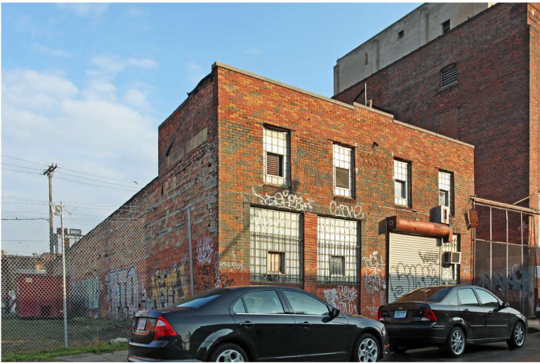
1533 WINDER OFFERED AT $141