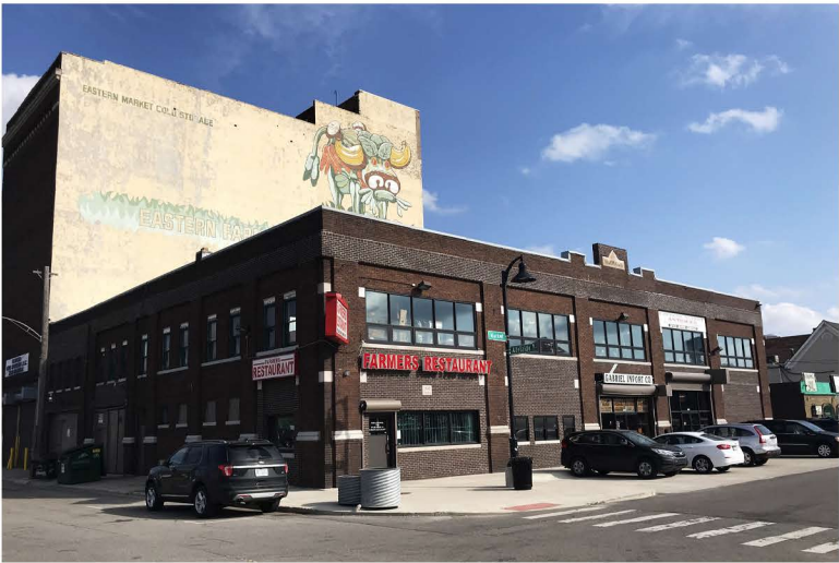
1468 ADELAIDE SOLD AT $150/SF