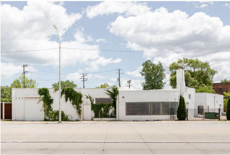
2930 GRATIOT SOLD AT $149/SF