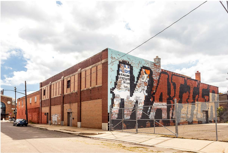
1350 & 1328 DIVISION OFFERED AT $118/SF