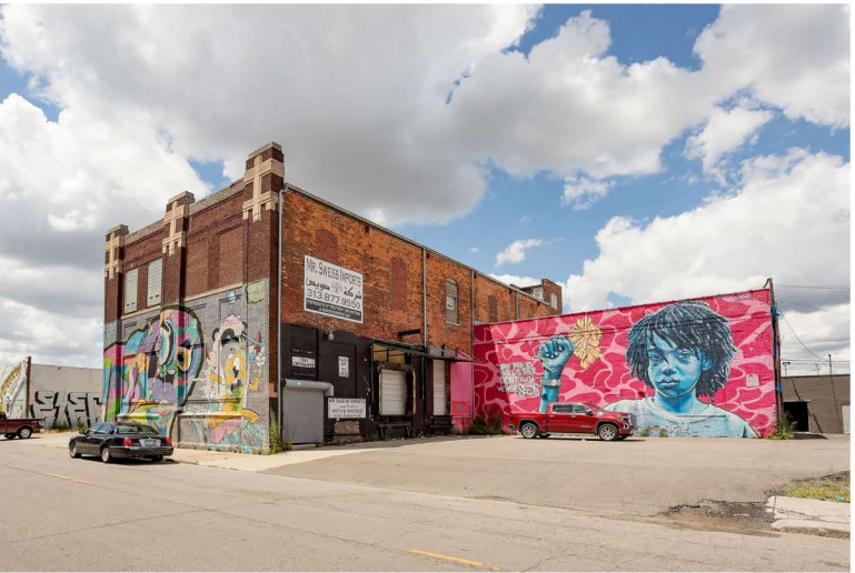
1561 ADELAIDE SOLD AT $147/SF