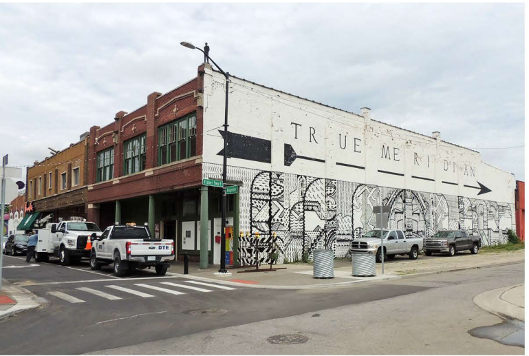
2700 ORLEANS SOLD AT $123/SF