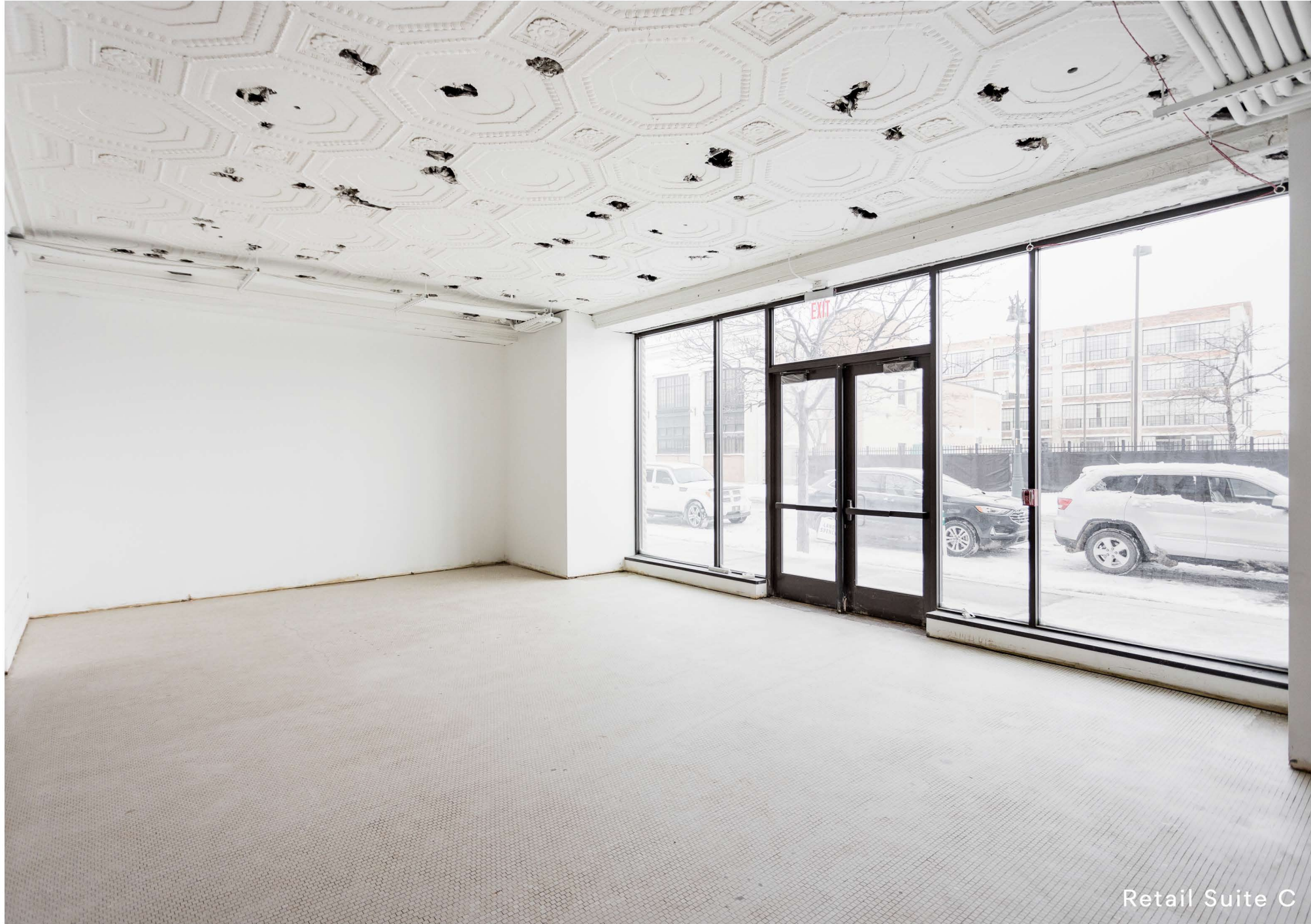
Retail Suite C